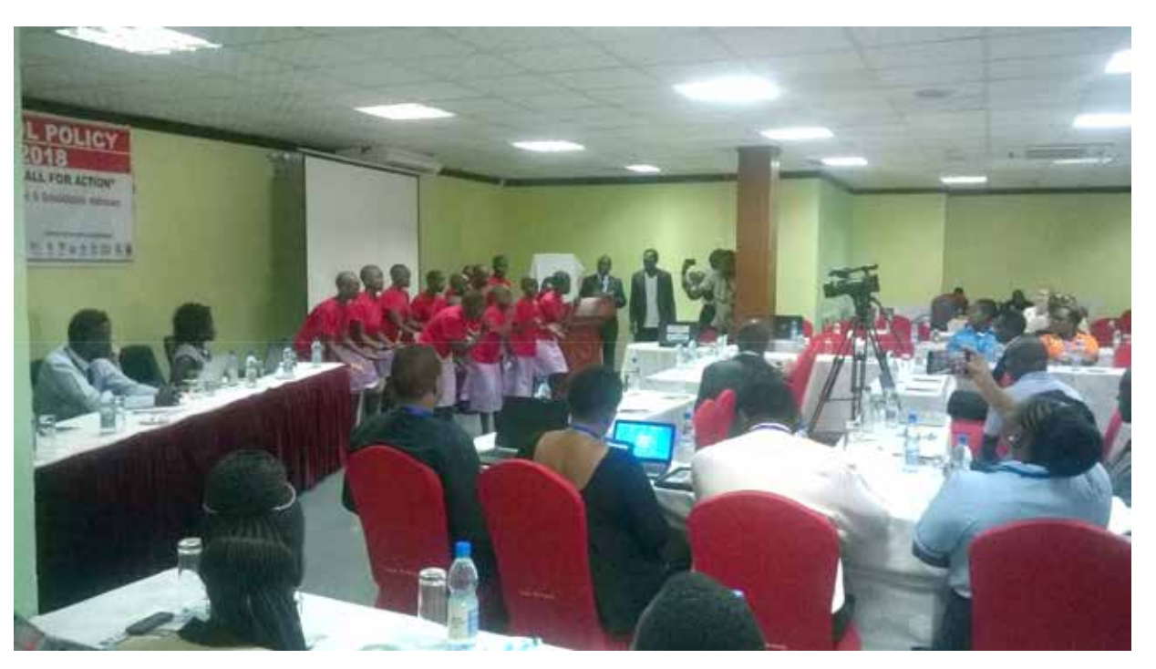
Children from Ring of Hope, Jinja performing at the opening ceremony