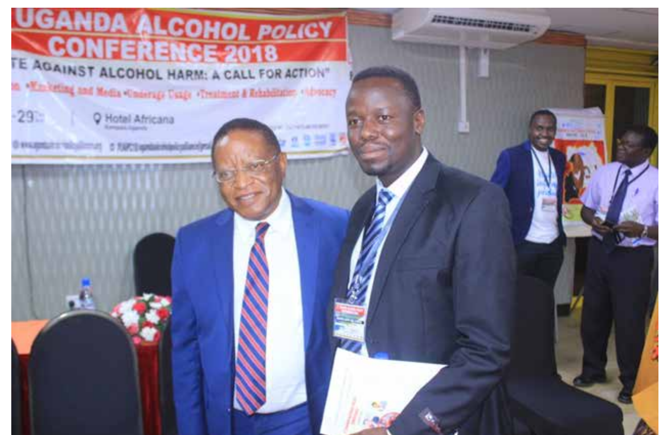
OAP C-TO Champerson and guest of nonor after the closure of the conference